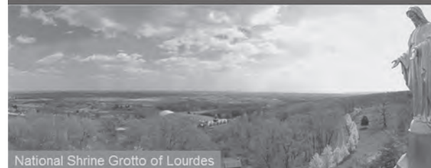
National Shrine Grotto of Lourdes

UNDER THE MANTLE OF OUR LADY OF LOURDES.