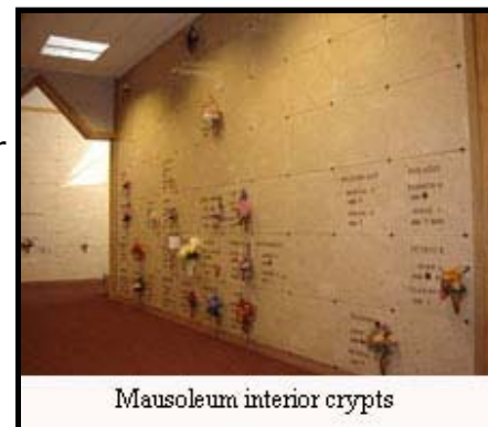
Mausoleum interior crypts

Crypt fronts are made of polished granite and are available inside and outside of the mausoleum. Typically upper and lower level crypts are less expensive than those located at eye level.